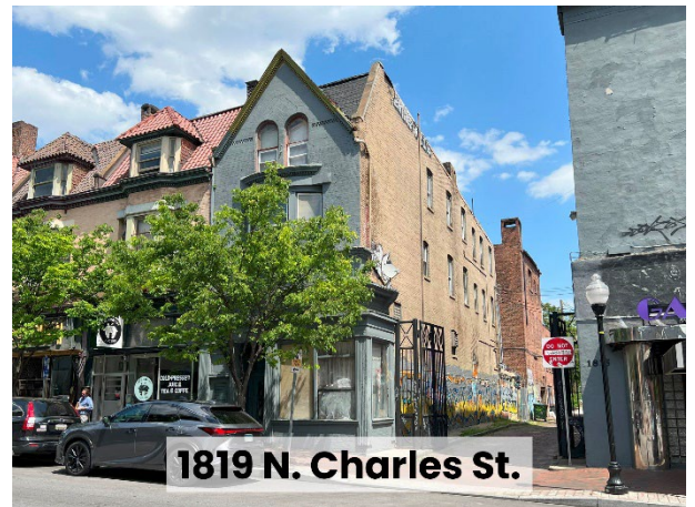
1819 N. Charles St.