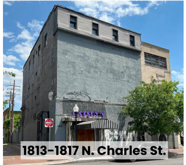
1813-1817 N. Charles St.