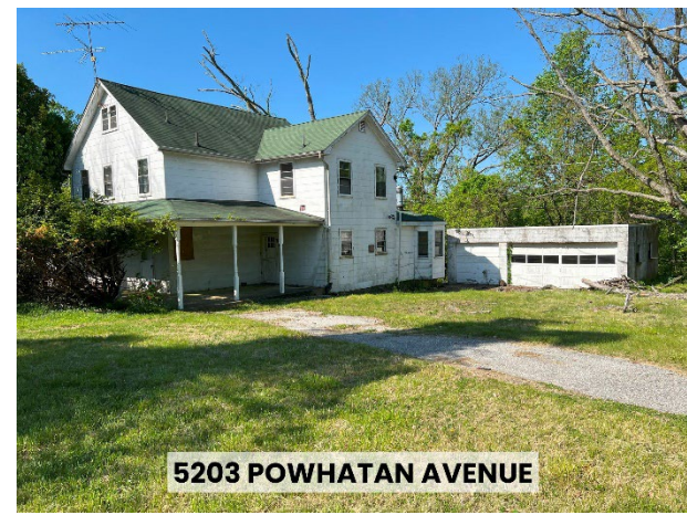
5203 POWHATAN AVENUE