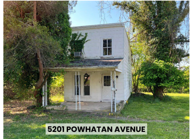
5201 POWHATAN AVENUE