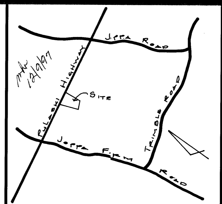
VICINITY MAP SCALE: 1" = 2000'

NOTE: BEARINGS SHOWN HEREON ARE BASED ON FINAL PLAT SEVEN, JOPPA CROSSING, DATED 11/4/91 AND RECORDED AMONG THE LAND RECORDS OF HARFORD COUNTY, MD IN PLAT BOOK 79, FOLIO 69.