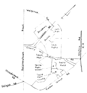
Location Plan Scale: 1"=2000'

R.R.G. 29 FOLIO 134 RECEIVED for Record APR 28 1964 at AM same day recorded in liber R.R.G. No. folio One of the Records of Baltimore County and ex- amined, per